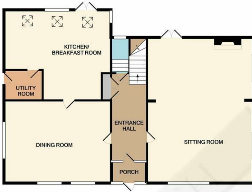
GROUND FLOOR APPROX. FLOOR AREA 1018 SQ.FT. (94.6 SQ.M.)