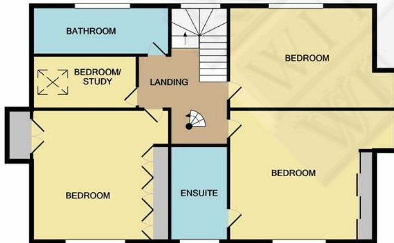
1ST FLOOR APPROX. FLOOR AREA 832 SQ.FT. (77.3 SQ.M.)

TOTAL APPROX. FLOOR AREA 2247 SQ.FT. (208.7 SQ.M.)